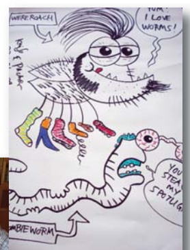
Illustrators Knife and Packer in action