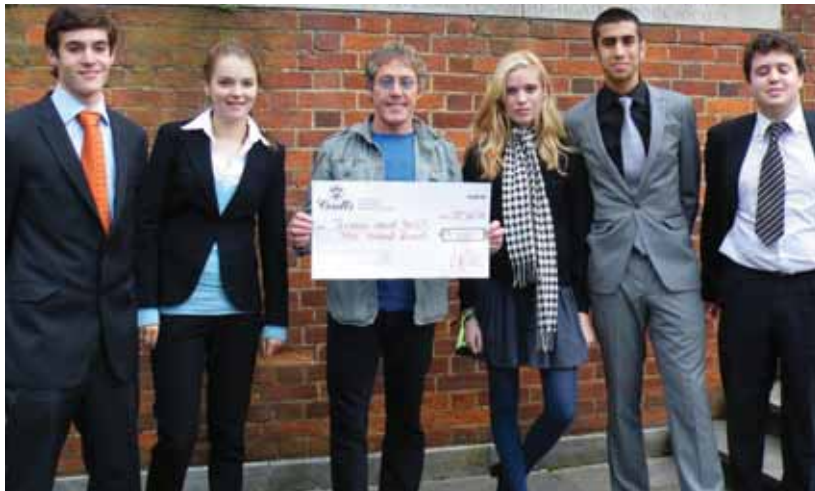
Roger Daltrey with members of Highgate School's Charity Committee

Roger Daltrey's involvement in this valuable enterprise began years ago. 'It all started with my