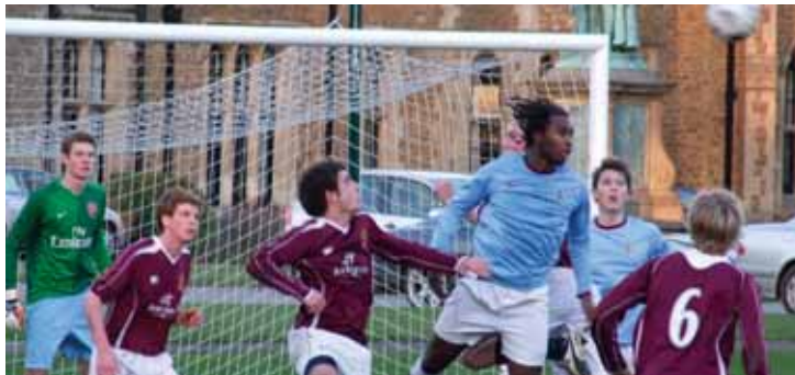
Members of the 1st XI, playing here against Charterhouse

The opportunity to break into this year's 1st XI has been difficult due to their success, but also