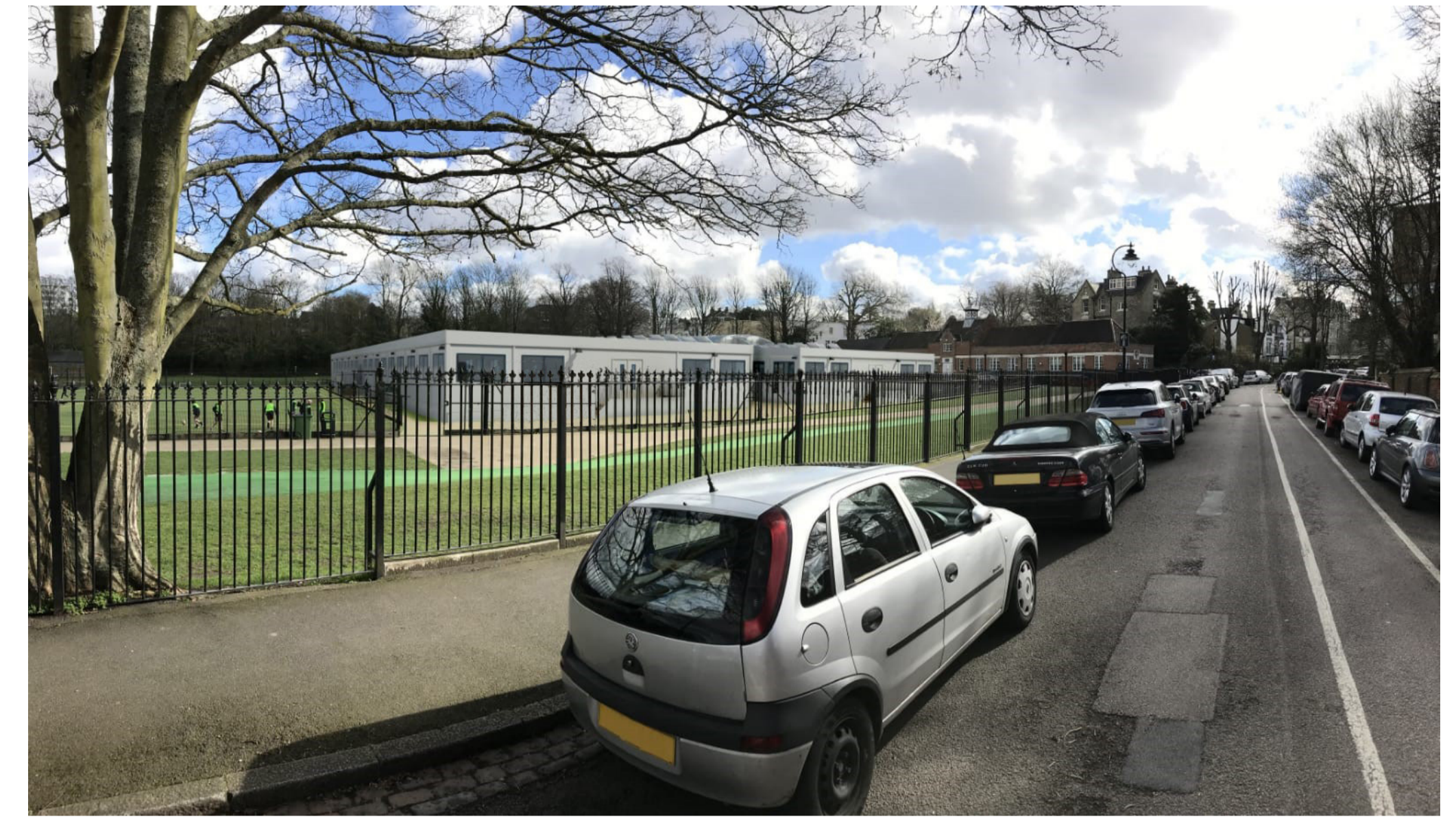
Proposed - view from Bishopswood Road looking south (artist's impression)

The School aims to maintain a high standard of physical environment for all pupils throughout this interim period, until the main redevelopment projects are completed. The School has experience in providing high quality temporary accommodation as demonstrated by the photos of the temporary Junior School building (in use between 2014 and 2016). The School fully reinstated the Senior Field following the removal of this temporary accommodation.