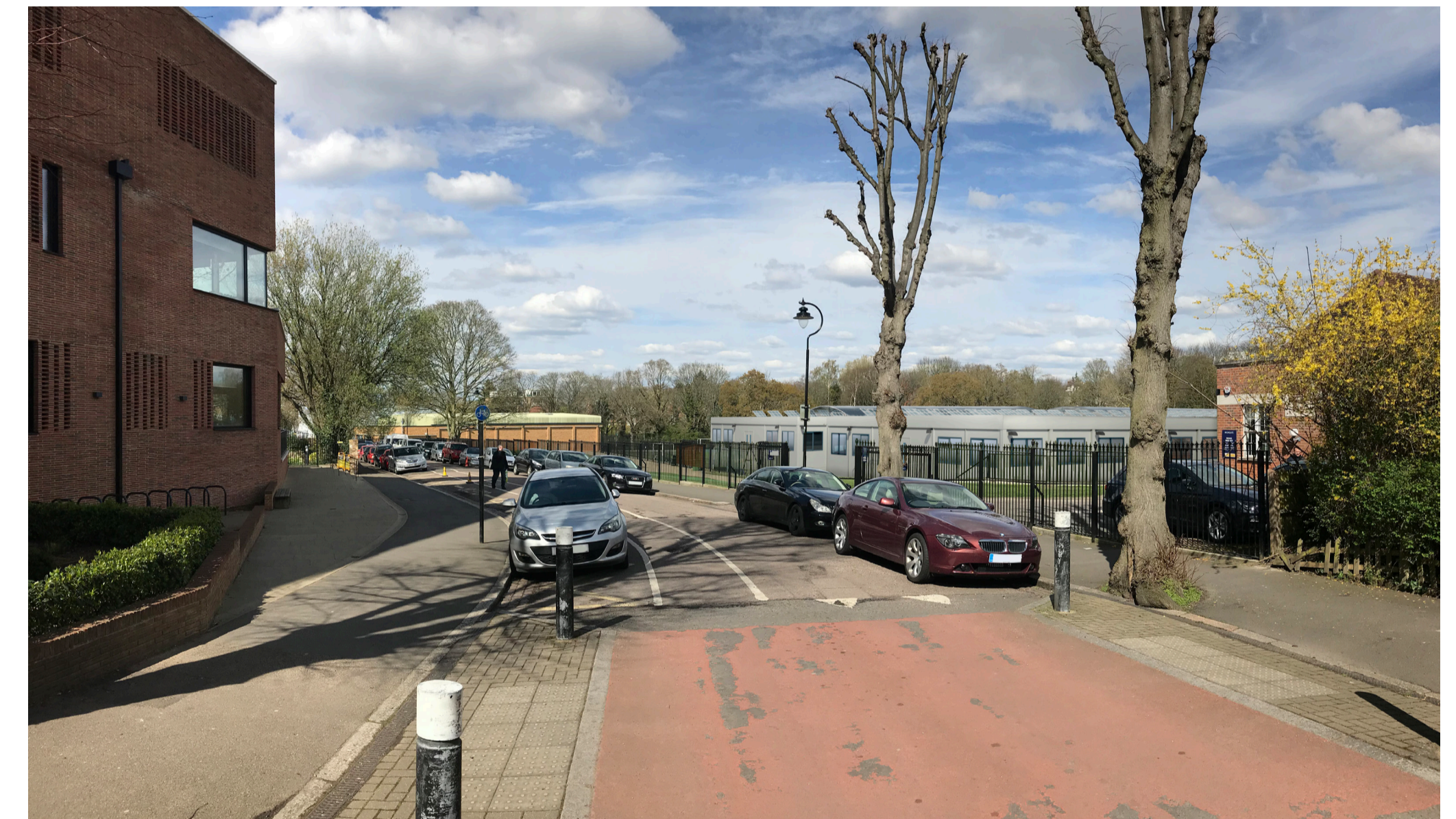
Proposed - view from Bishopswood Road looking north (artist's impression)