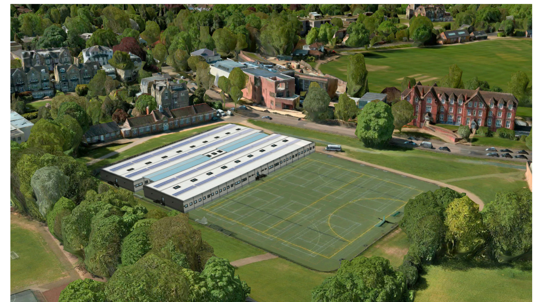
Proposed - aerial view looking south-west (artist's impression)