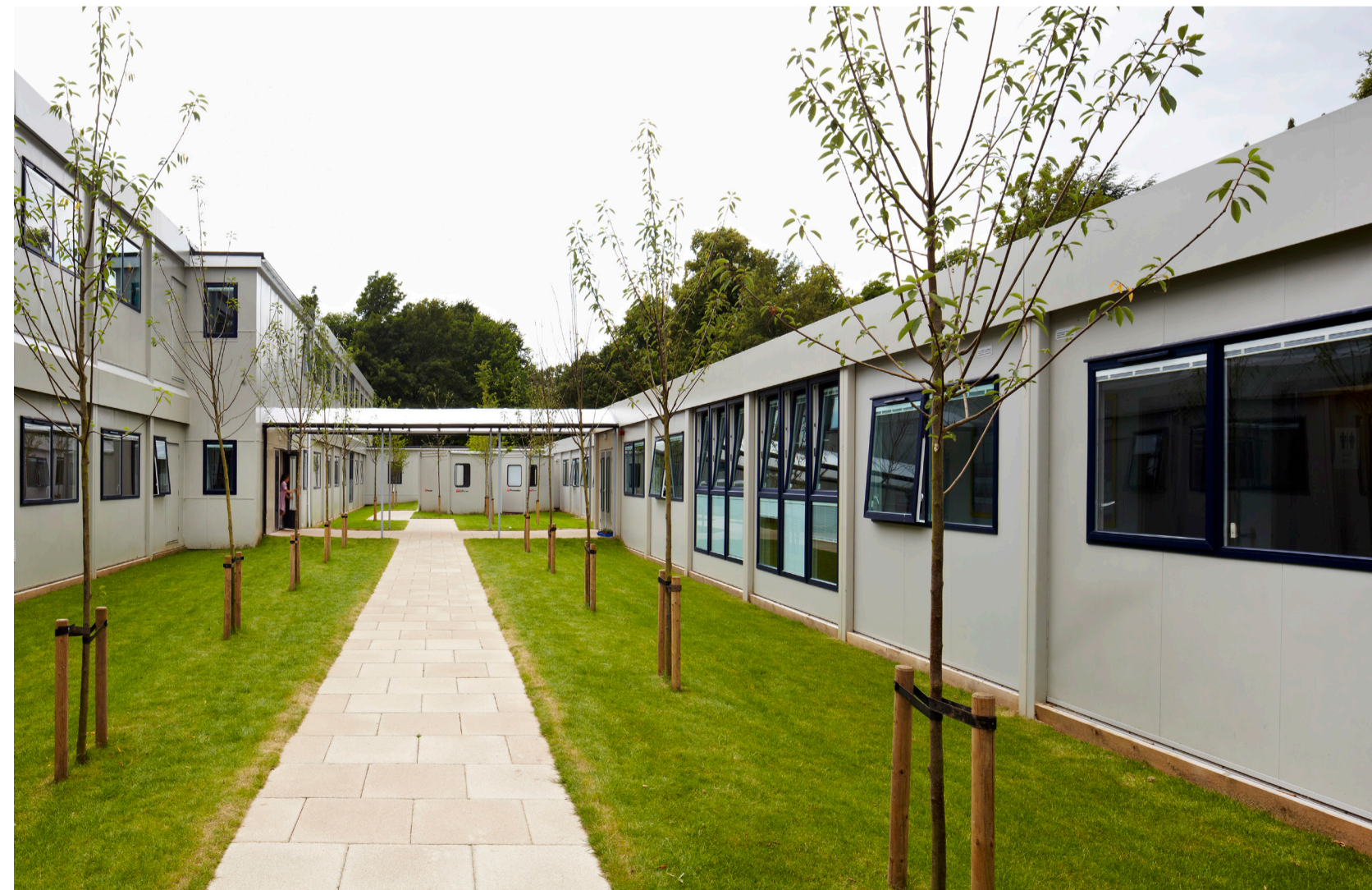
2014-2016 Temporary Junior School

The temporary building is intended to provide teaching facilities to cater for the decanting requirements of three proposed schemes (Science Block, Dyne House and Richards Music Centre) on a rolling programme over the period of around 6 years. The main redevelopment works will require the affected existing buildings at the Senior School to be fully vacated. It will be therefore impossible to maintain the daily educational operations of the Senior School in the existing buildings. It is important that Senior School facilities, even if in their temporary home, remain located within close proximity or en route to other School facilities such as Dining, Sports and communal Foundation facilities such as the Mills Centre for Art and Design Technology and Engineering.