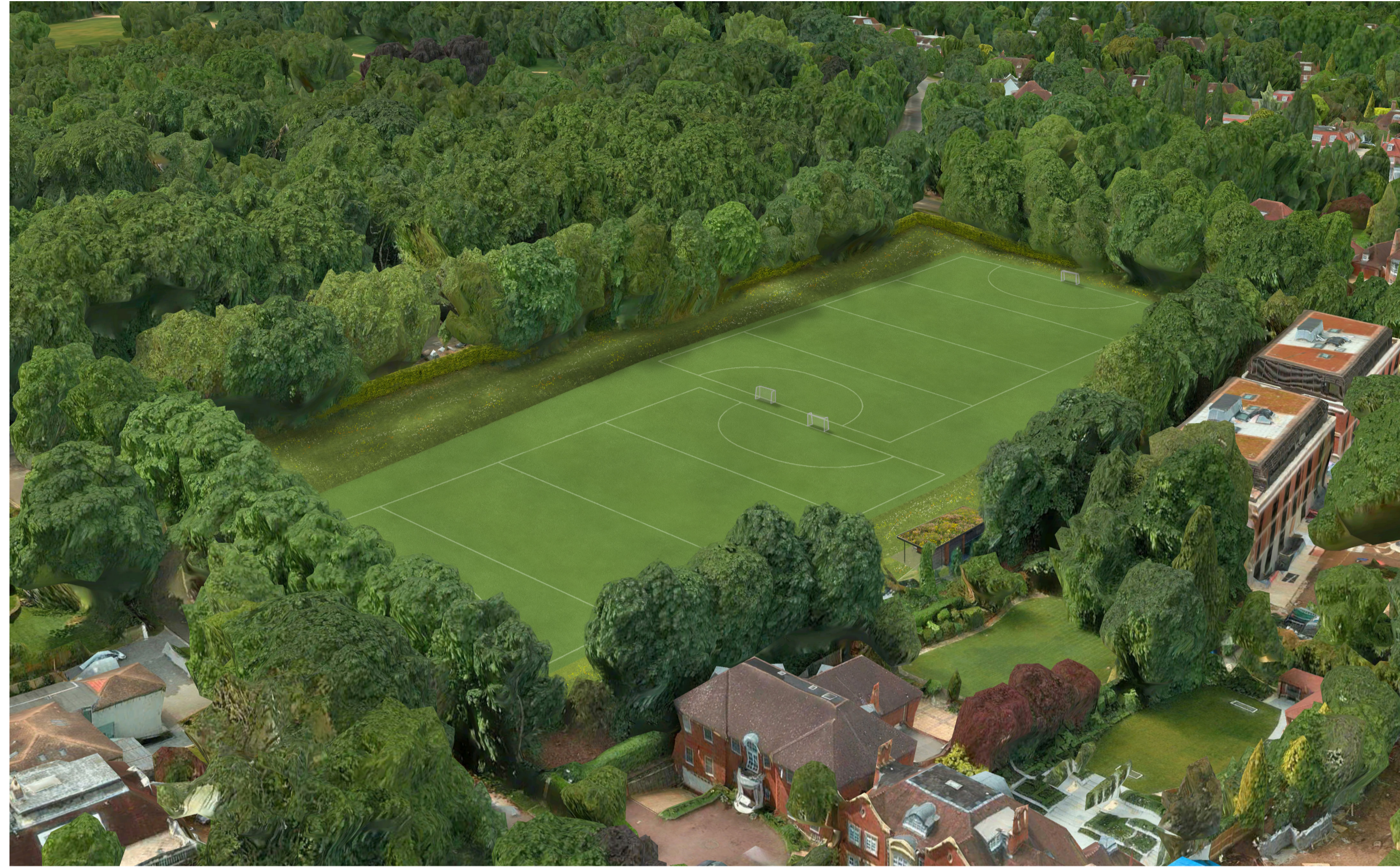
Aerial View and Plan of Proposed - showing hockey markings (artist's impression)