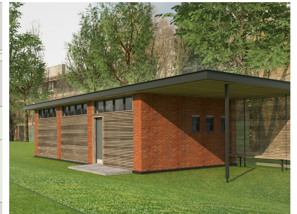
proposed changing pavilion refurbishment