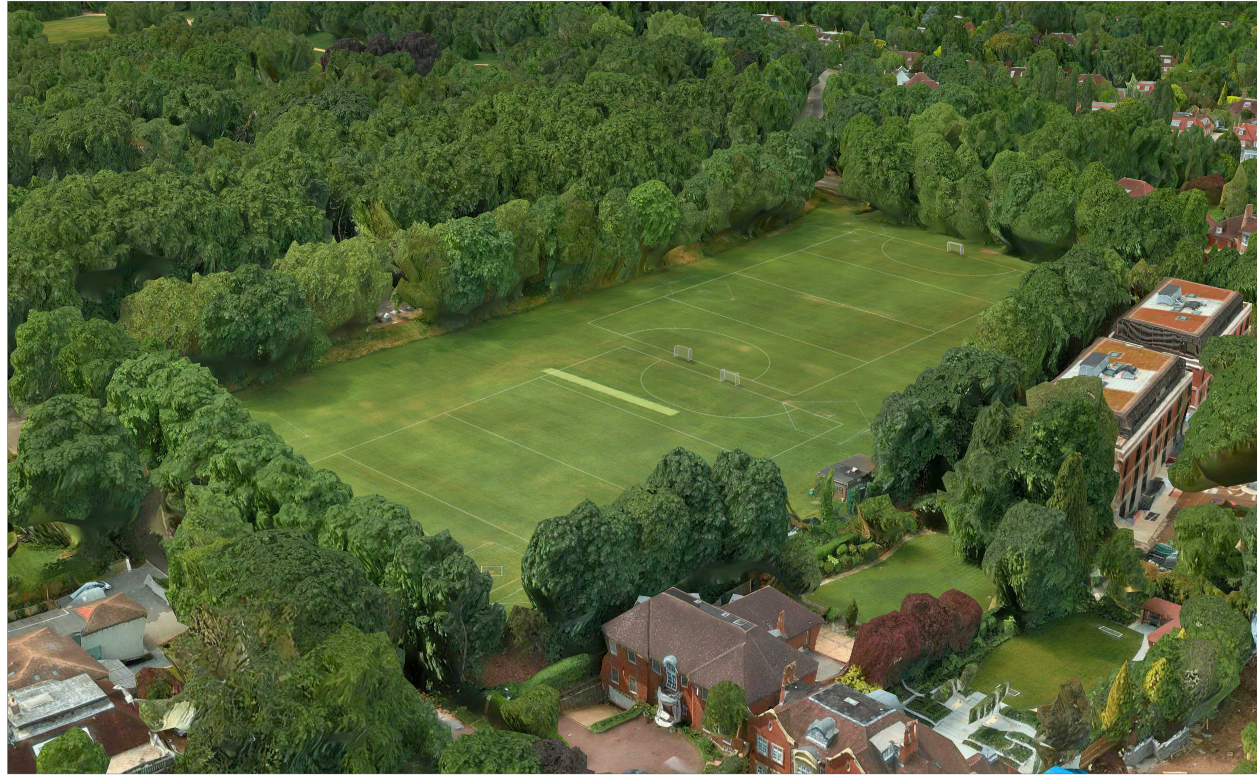
Aerial View and Plan of Existing - hockey pitches shown for reference