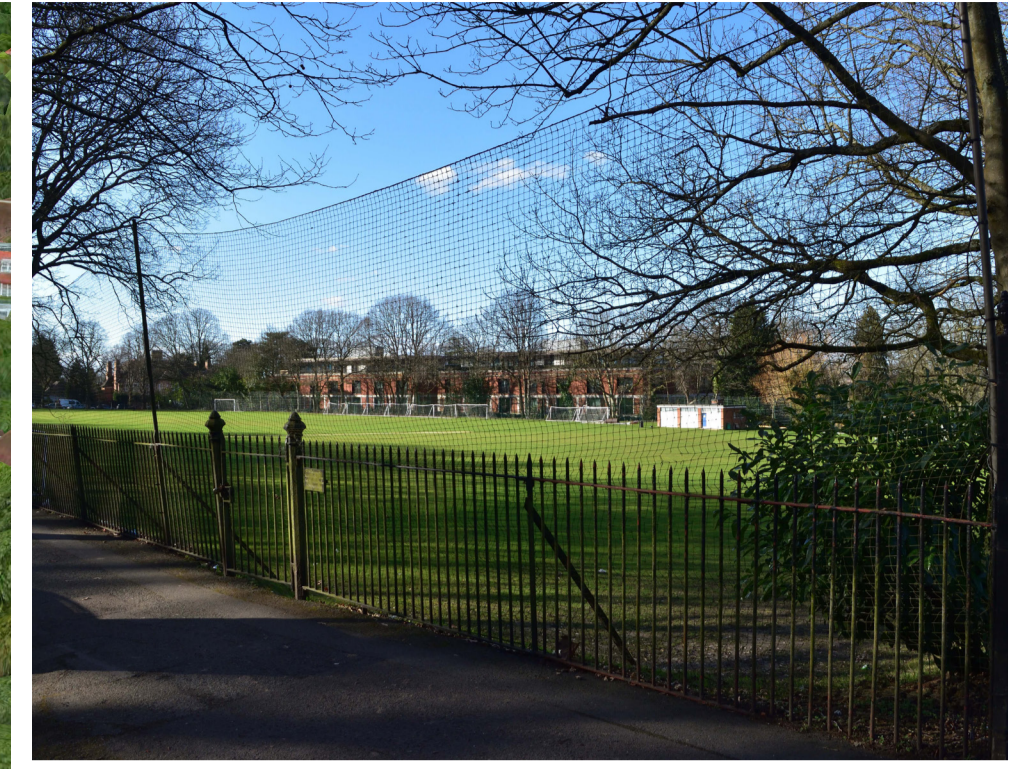
existing & proposed - view from south-east