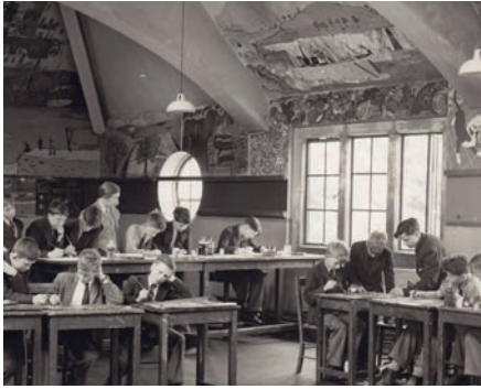
Kyffin Williams in art studio